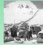
Climbing the Chilkoot Pass