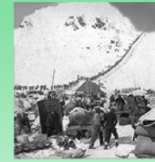
Climbing the Chilkoot Pass